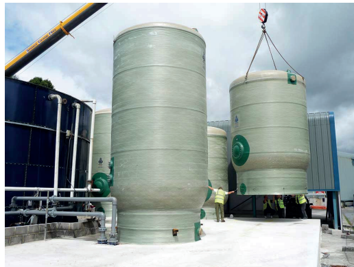
2 x 60m 3 and 3 x 80m 3 grit and fibre settlement tanks – process water recycling plant – Axminster Carpets