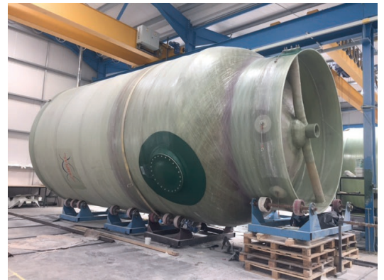
91m 3 residue settlement tank - water recycling plant - major vegetable producer