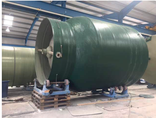
64m 3 grit settlement and treatment tank for effluent collected by gully suckers and sludge gulpers.